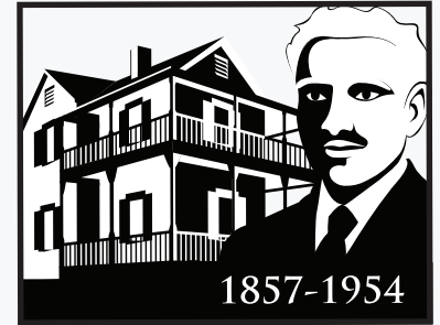
PRESERVING HISTORY & CULTURE